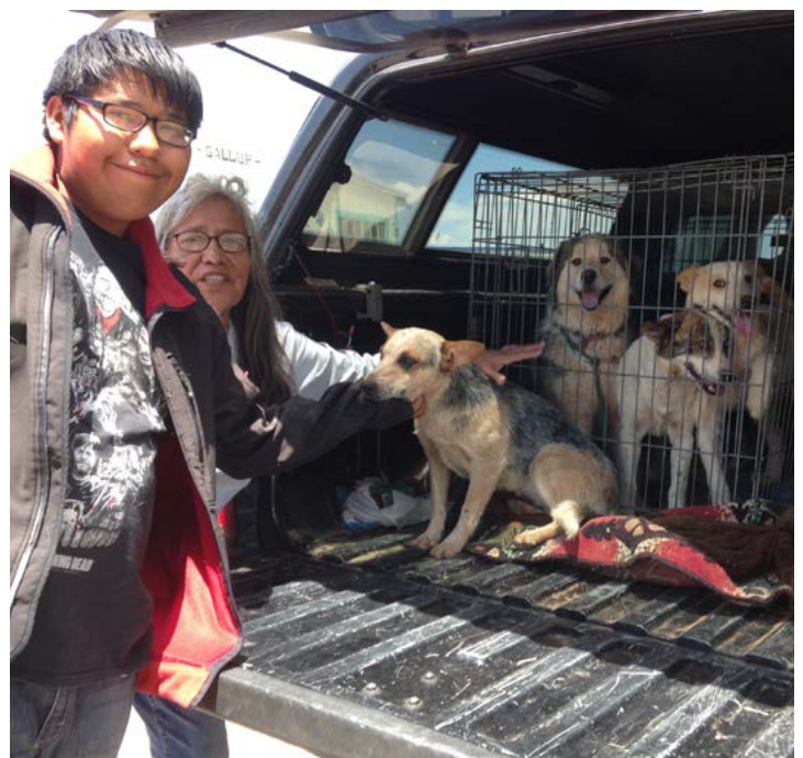
Shelter visitors bring their dogs for spay/neuter surgeries.

tremendous impact that can be achieved through donors' legacy planning and planned giving.